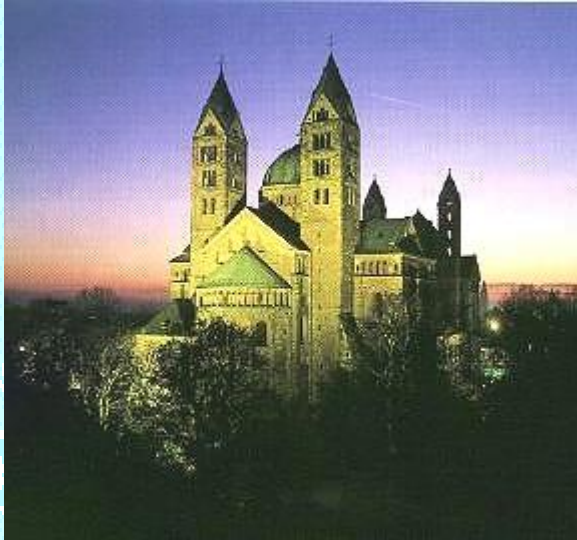
Der Dom an Speyer