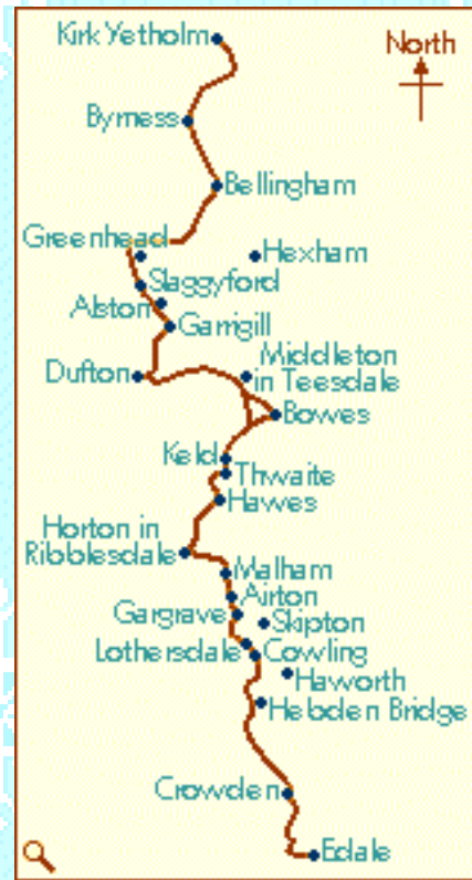
The Pennine Way

Anyone fancy a "Walk on the Moors" for two weeks next July?