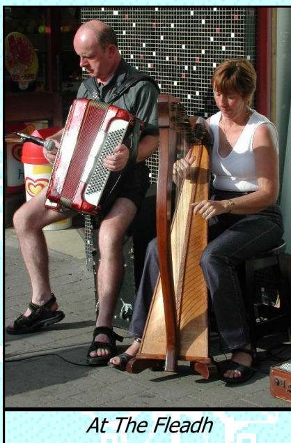
At The Fleadh

Record: "Little Lights" by Kate Rusby Book: "Down Under" by Bill Bryson Exhibition: "Origins" (of course) at Bolton Performance: The Eagles at the MEN Arena,