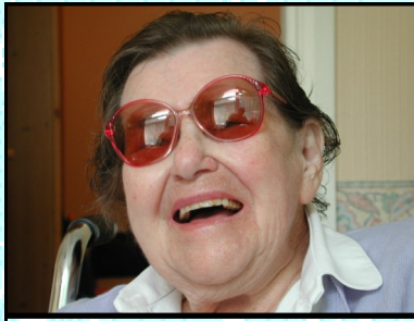
Mum in Cornwall

Later in the summer, Noelene and I took off for Ireland again, seeing mainly the west coast, a bit of the north but spending most of our time in the south west at the Festival of Tralee and the All Ireland Fleadh. Again, the weather was perfect, the people wonderfully friendly, B&B and campsite spot on and the food and drink not too bad either.