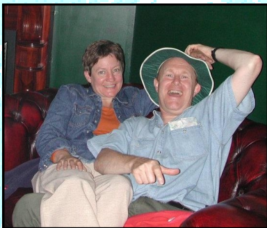
In The Green!

The easy bit of this article is that I'm still going to German classes every Monday evening and trying to learn the language. But the intricacies of relative clauses of the genitive case don't do a lot for me and the wheels are rapidly coming off of my