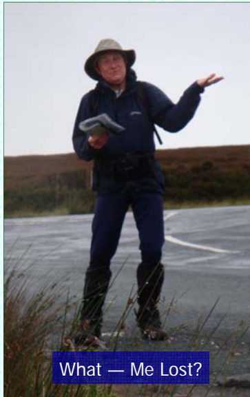
What — Me Lost?