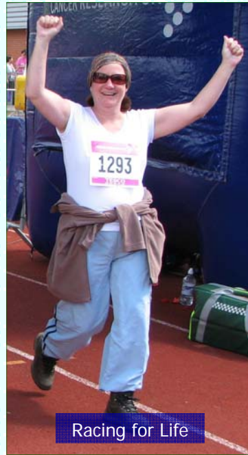
Racing for Life