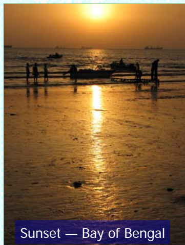
Sunset — Bay of Bengal

Maybe next year we'll get to Bridlington (but see over the page!).