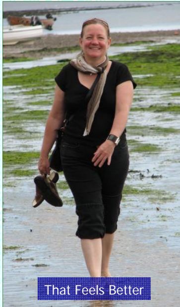
That Feels Better