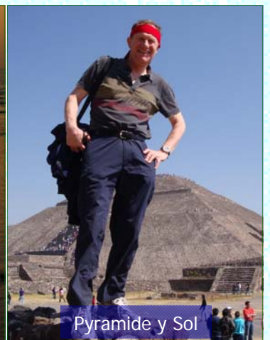
Pyramide y Sol