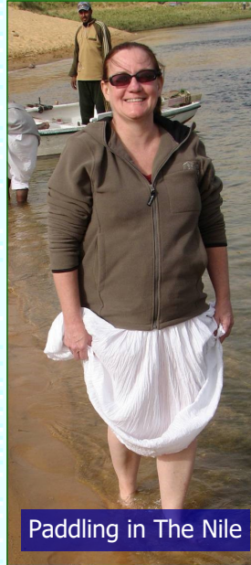
Paddling in The Nile