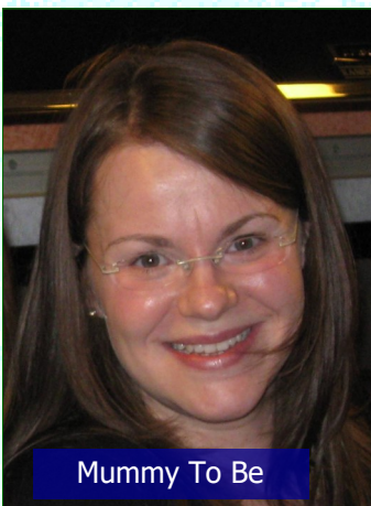
Mummy To Be