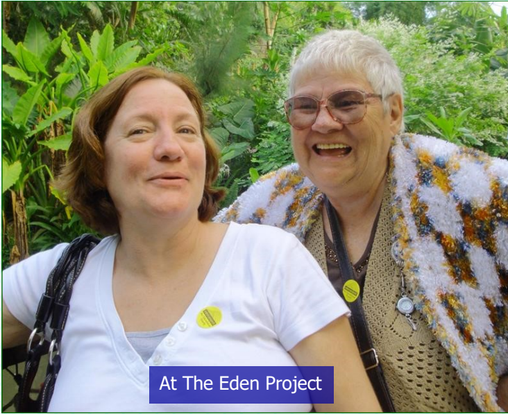
At The Eden Project