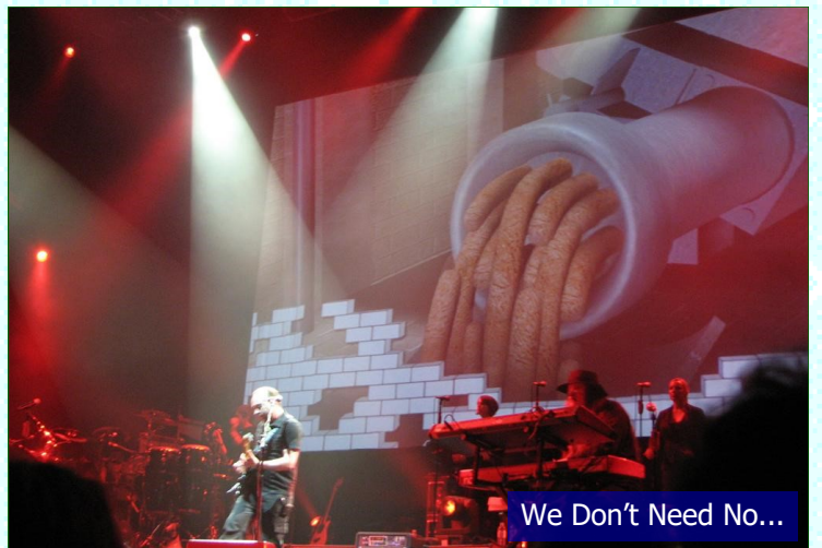
We Don't Need No...

If you like our photos you can see lots more of them at: http://picasaweb.google.com/giblets09 . You never know, you might just spot yourself in one or two of them!