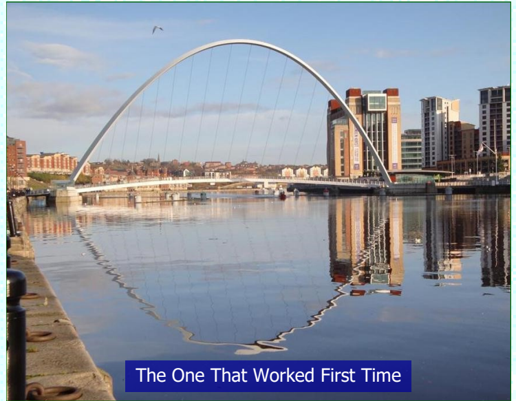
The One That Worked First Time

A s always we've run out of space but there's more at www.gillatt.org/2009 . There's also no room for our Top Ten of the year yet again. But number one this and every year is the love of our families and all our friends — which we send in return to you all.