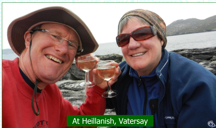
At Heillanish, Vatersay

Sundays. But we agree that they're really spectacular with unbelievable beaches, excellent food and great places to stay. Get there if you can or read all about it at www.gillatt.org/hebrides .