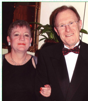
Harrogate in November