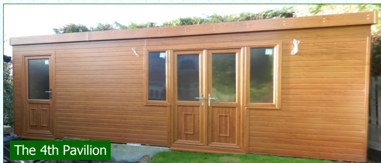
The 4th Pavilion

I t was going to be just a small shed behind the existing Wendy House in the back garden. But, nine months later, we've ended up with a rather splendid three bedroom, double en-suite, kitchen, diner pavilion. Well maybe not quite , but it is ideal for those summer parties that we like so much! And, in the Spring, down will come the old studio as Noelene, our very own Felicity Kendal, expands her veggie plot, installs the chicken house, pigsty and brings in a couple of sheep to keep the lawn trim!