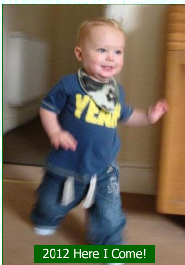
2012 Here I Come!