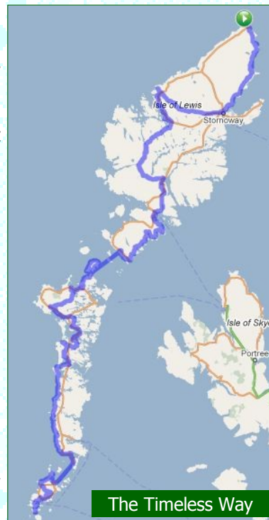
The Timeless Way

My Sherpa has a somewhat jaded view of these wonderful islands, especially since absolutely everything closes on