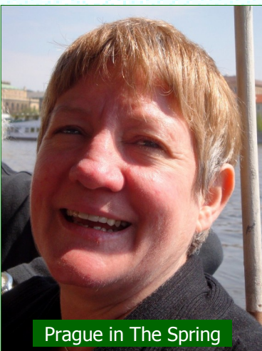
Prague in The Spring