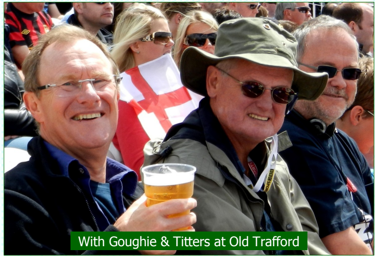
With Goughie & Titters at Old Trafford