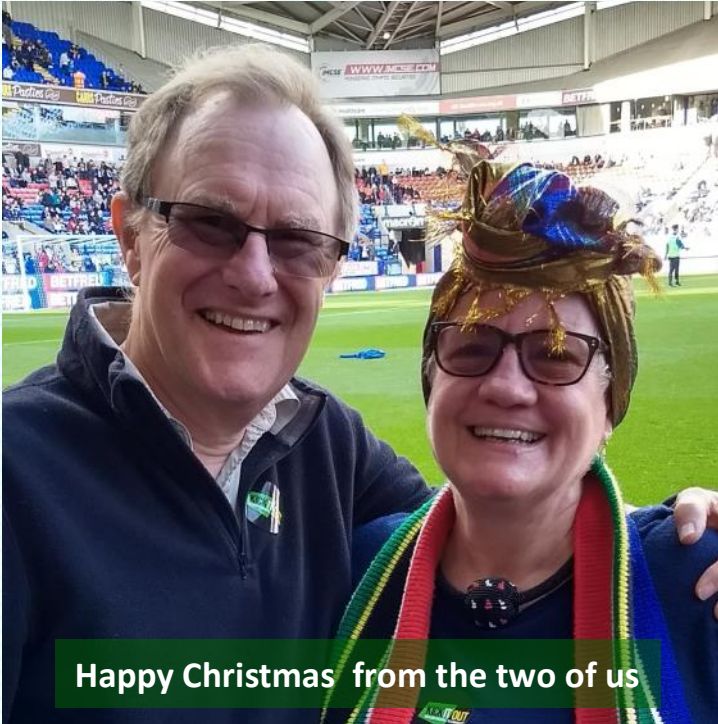
Happy Christmas from the two of us