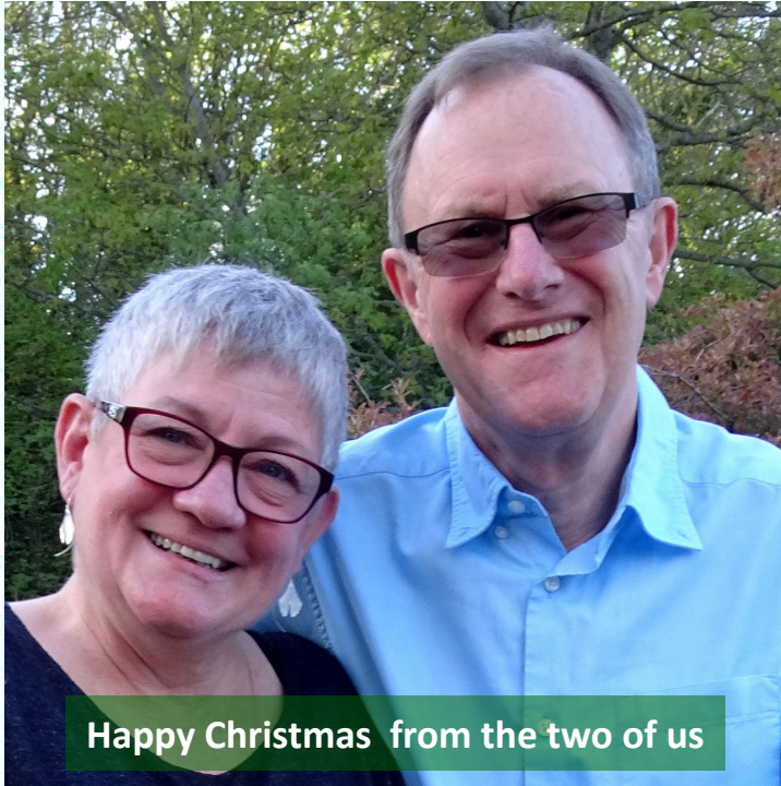
Happy Christmas from the two of us